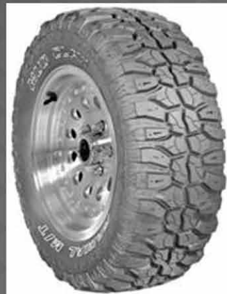
Telstar Mud Claw