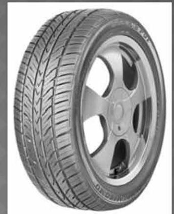
Sumitomo A/S P01