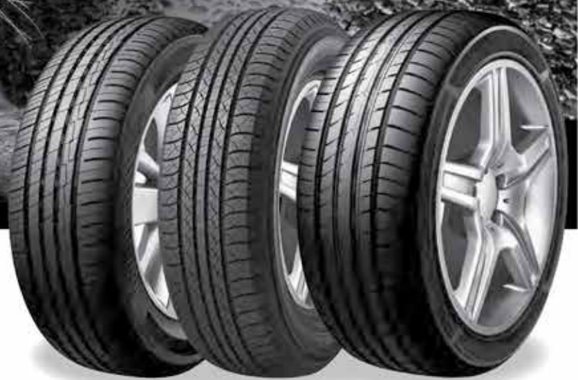
RC-17 EL JEFE H/T Muchomacho

Excellent Quality at an Affordable Price